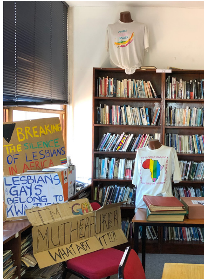
An selection of objects from the archive in the GALA Library, 2020, Johannesburg, South Africa

2.2. Education and training: We facilitate sensitivity training programmes with various stakeholders, with a focus on institutions of higher education and SOGIESC (Sexual Orientation, Gender Identity and Expression, and Sex Characteristics). We collaborate with various partners who specialise in cross cutting issues such as disability, Gender Based Violence and Comprehensive Sex Education to facilitate educational programmes.