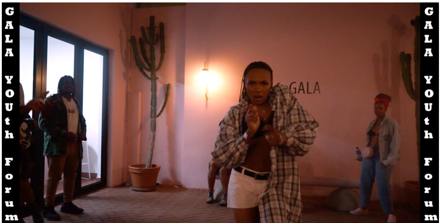
Still from a short video of the GALA YOUTH Ball

GALA YOUTH Ball: Be Who You Are For Your Pride: In October 2022, the GALA YOUTH Ball was hosted on Wits university premises to provide a space for community building amongst students. The involvement of GALA's programmes coordinator, YOUTH Forum coordinator and intern, and that of the youth forum members led the ball to its success. GALA decided to plan and organise a ball that would be accessible to queer youth. We developed incentives like sponsoring a student with a ticket, asking working people to pay more, and also giving out free tickets. Funds that were raised went towards covering the shortfall of the budget. Be Who You Are For Your Pride was the theme for the ball that we believed would allow people to come as they are and not hold them to any cultural ways of being that similar events do. People who walked the ball categories won House of GALA T-shirts. We also opened the ball to function as an experiential space by calling for artists within the community to exhibit their works of art. It was indeed a time for all of us and our partners to reflect on the work we have achieved throughout the year. The GALA YOUTH Ball created a space for queer youth self-expression and we believe that this created a space that can foster further queer and youth focused movement building.