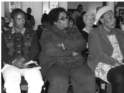
Simon Nkoli's mother (centre) at the launch of 'Till the Time of Trial'.